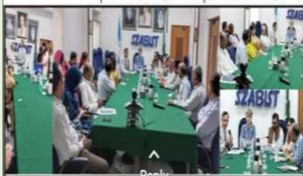
کراچی، زیسٹ سسٹین ایبل ڈویلپمنٹ ریسرچ اینڈ ٹریننگ سینٹر اور فریڈرک نویمان فاؤنڈیشن کے اشتراک سے ماہرانہ بحث کی جہاں سے